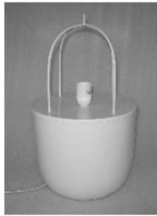
A (BASE) (1PC)